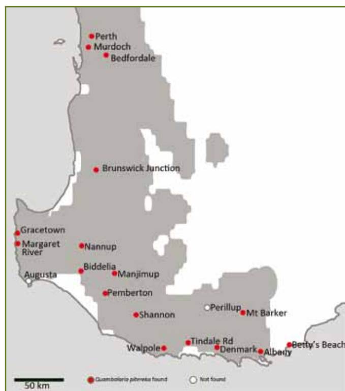
Figure 1 Quambalaria pitereka was found across southwest WA during surveys conducted from April 2009 to May 2010. Only two of 17 sites surveyed did not test positive for Q. pitereka .

Quambalaria pitereka was isolated from the carpels, and occasionally also from the 'disc' (or 'ovary roof') above the affected carpel (Fig.3). On one occasion Q. pitereka was isolated from the pollen of an infected flower bud, which presents significant risk for transmission of the disease by pollinators.