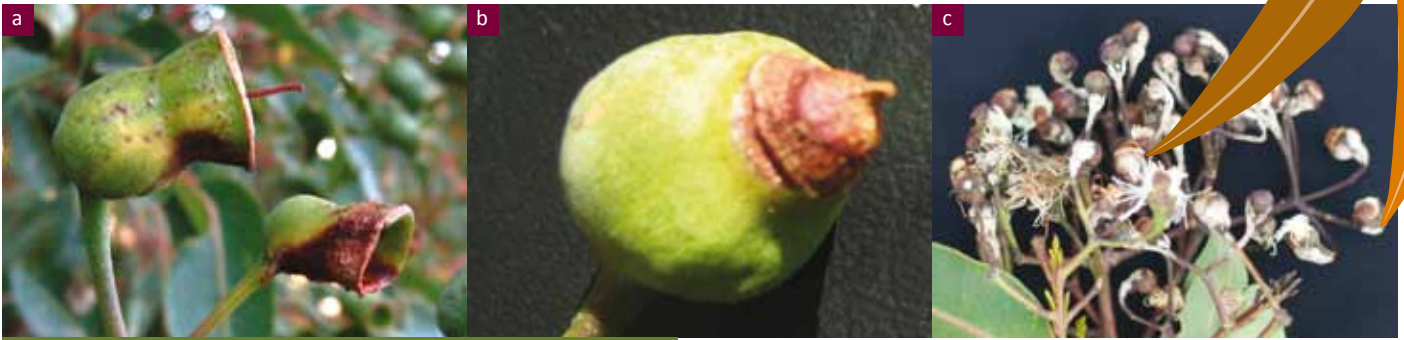
Figure 2 Quambalaria infection of flower buds can lead to deformities such as 'horizontal' growth of fruit (a) and unsuccessful operculum opening (b), or complete termination of the flowers (c).

Infection of the developing fruit may arise opportunistically due to wounding or infection of the ovaries. Infected fruit grow in a deformed 'horizontal' pattern (Figures 2b, 4b), caused by infection of one or more carpels at early stages in the flower's development. The horizontal growth habit results in significantly smaller fruit and seeds and a severe reduction in the number of seeds produced per fruit. Most 'horizontal' fruit contains no seeds.