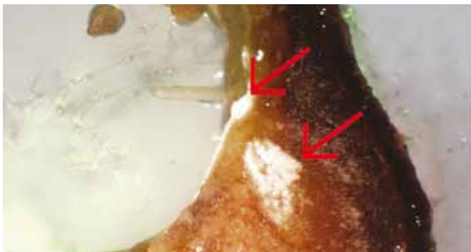
Figure 3 Quambalaria pitereka sporulating on internal flower bud tissues – from the carpel and disc (arrows) after 3 days incubation on half strength potato dextrose agar (Bar = 2 mm).

Quambalaria pitereka was first collected in WA from an amenity-planted C. ficifolia in 1993. By 2004, the disease had spread amongst amenity-planted C. ficifolia , on to natural